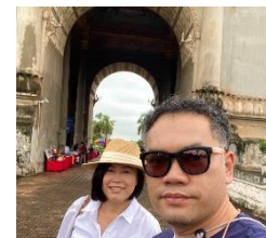
On vacation in Northern Laos