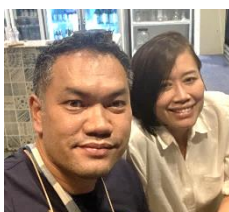
Enjoying each other's company

Northeast Thailand (Isan) comprises 1/3 of Thailand's total population and landmass – the most spiritually-parched region with 99% being Buddhist. Isan has 43,000 remote rice-farmer villages. Yet only 2% are considered reached, the remaining 98% having had no Gospel exposure. The number of born-again Christians in this vast village hinterland is about 0.1%, with relatively few missionaries. However, they now have the Word of God in their own Isan language with a potential readership of 28 million – over 30 million including Laos and Lao refugees.